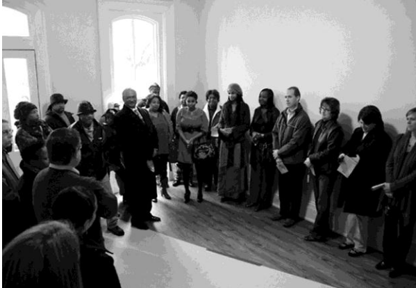
The dedicaton ceremony of 1522-1524 Elm Street

The 1522-1524 Elm Street full gut rehab was noted as Habitat's most ambitious rehab project to date as attendees of the dedication ceremony filled the living room of 1522 Elm Street to meet the home's new residents and honor those who helped with the project. The project is considered to be an historic renovation and it is LEED-certified. A big congratulations to Habitat for this extraordinary accomplishment.