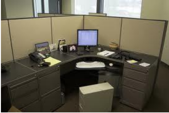
The back office project - helping fill in the gaps in resources for website, HR and accounting.

Community Development Corporations Association of Greater Cincinnati Winter 2012 Newsletter